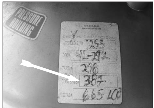
(Far left) Photo #4--Interior installation. The arrow is pointing to CO2 supply line going to the exterior of the building. (Left) Photo #5--Typical exterior installation of Dewar-type CO2 cylinder. (Above) Photo #6--Top of cylinder. Note ID plate attached to the top of the cylinder. The arrow is pointing to the total contents in lbs. when full (387 for this size).

Carbon dioxide was determined to cause the death of two people in a Sanford, Florida, McDonald's in 2005. An 18-year-old McDonald's employee was trying to help a driver for the company that refills the CO2 tanks when he died of asphyxiation. The 50-year-old driver died when he tried to help the teen.