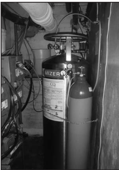
Photo #9--Typical basement installation. Note the amount of plastic tubing present. Also note the system is installed onto the side of a walk-in refrigerator. A leak into this area could quickly displace O2.

DOT 4L292, known in the industry as the "292." This cylinder stores CO2 in its liquid form and is passed through a regulator as a gas to be used. On the top of the cylinder, numerous valves can be found, many with tubing running from them. Shutting down the valve with the regulator will isolate the cylinder supply to the soda system.