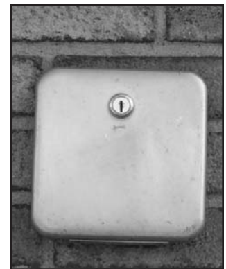
Photos #7 and #8--Exterior fill connection shown in the open and closed positions. Often the cylinder will be located opposite this wall as long as there is access to this location for the supply truck. This would be a clear indication that CO2 cylinders are located inside.