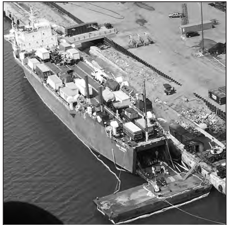
This air recon photo was taken days later after the ship was brought into a repair facility in New Jersey. Firefighters were unable to open the stern ramp during the fire. The vehicles shown on deck were inside the ship on the lower deck at the time of the fire. No vehicles were on the deck during the fire.