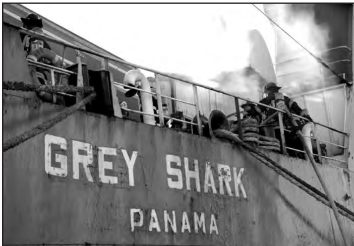
Under whipping winds and high waves, a fire broke out on the trailer deck of the Grey Shark when cargo shifted and a loaded trailer broke free and landed on top of another vehicle.