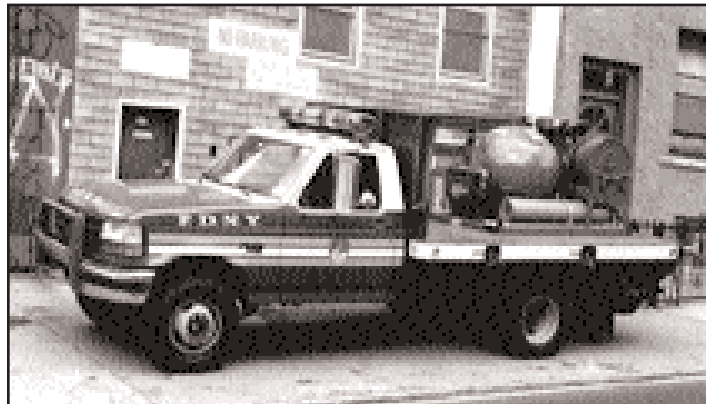
A 1000-pound dry chemical skid-mount package is mounted on a small flat-bed truck. The Department has two of these units in service.