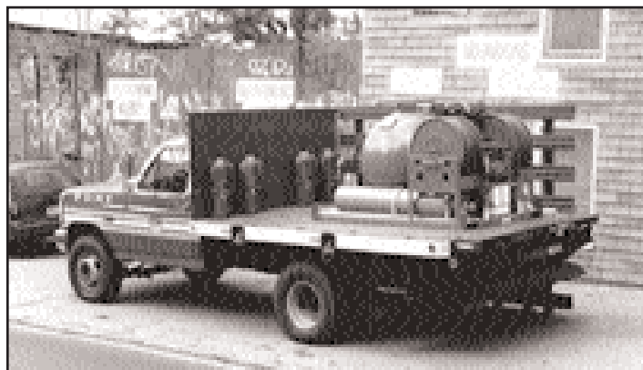
This view shows the two hose reels and the four portable dry chemical extinguishers that also are carried by these units.