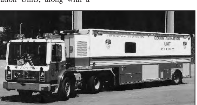
(Above) Decon 1, quartered with Ladder 15, is a 1987 Mack tractor, pulling a 1995 SuperVac trailer. (Below) The Decon Support Unit utilizes an apparatus assembled at the Shops. It is quartered at the Special Operations Command on Roosevelt Island.

Once either Decontamination Unit is at the scene of an operation and set up, the actual decontamination procedures are performed by members of one of the Squad Companies. If medical