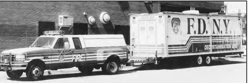
Decon 2 is pulled by a 1997 Ford pickup.