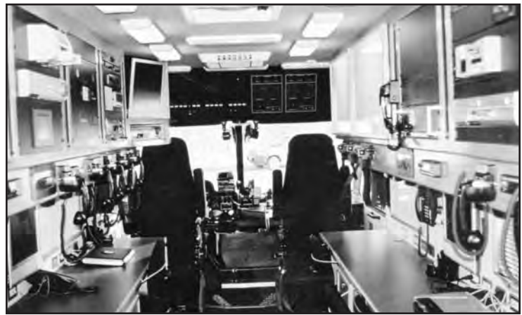
The heart and soul of the FDNY Mobile Command Center-looking forward into the Operations area.

Each apparatus is equipped with a camera mounted on a 42foot pneumatic mast that can provide a 360-degree view of the scene around the vehicle. Additionally, each vehicle is equipped with four surveillance cameras, two 40-inch, flat-panel, LCD monitors, a 16-channel digital video recorder, a 40-channel audio recorder for radio and telephone traffic, two 12 kW generators and a 6000-watt pneumatic light tower. There are also state-of-the-art radios, which facilitate interoperability between FDNY and other agencies. The vehicles have the capability to access a video link from NYPD Aviation units, as well as the ability to transmit video and data to the Fire Department Operations Center (FDOC) at FDNY Headquarters.