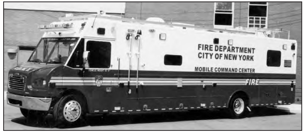
Mobile Command Center 1 serves as an FDNY Command Post at large-scale, long-duration incidents.