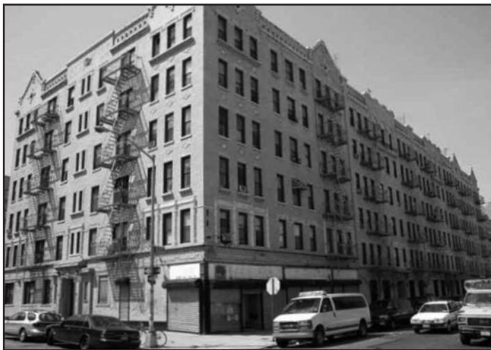
Photo #7--H-type apartment building (O-shaped, H-type). There are numerous fire escapes, with three visible from the street. Others will be on sides, rear and throat areas.

will be at least two interior stairs, with one stair generally found in each wing. There will be numerous fire escapes (perhaps 10 or more, depending on dimensions) found on these buildings, including front, rear and throat areas.